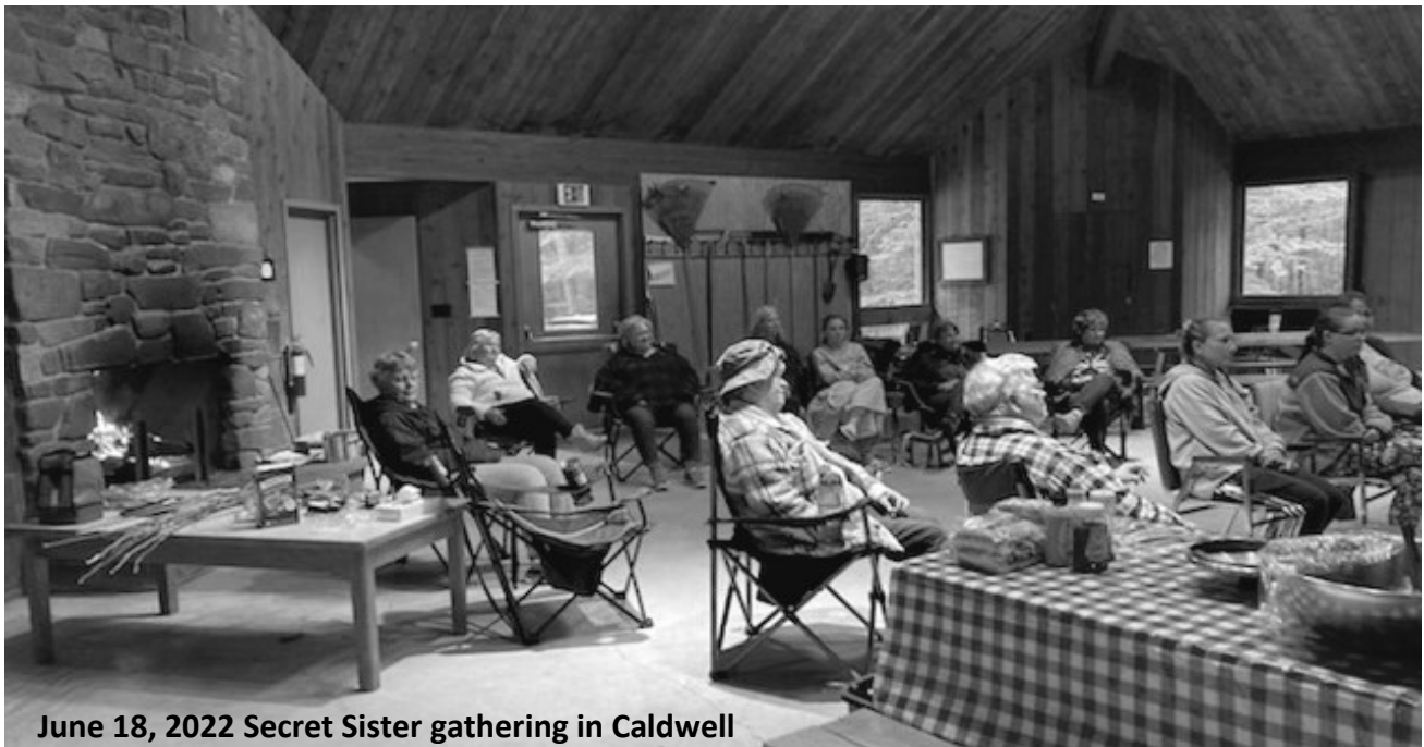
June 18, 2022 Secret Sister gathering in Caldwell